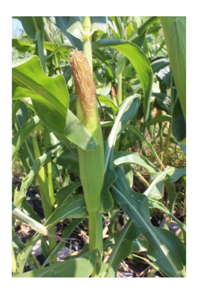
Figure 1: Silk stage

more extreme weather events with droughts and famines on one extreme and floods and hurricanes on the other (Seager et al., 2007; Meehl et al., 2000; EPA, 2016). This more extreme variation in temperature and precipitation can prevent efficient crop growth. One evident example was the corn yield across the U.S. corn belt in 2010 and 2012, during which high nighttime temperatures contributed to smaller yields (EPA, 2016). In terms of monetary loss, Michigan forfeited $220 million in the cherry sales of 2012 due to premature budding caused by a warm winter (EPA, 2016). For farmers, this means a higher probability of losing their crops due to lack of ability to fund (as well as supply) supplemental irrigation or to protect against floods. Drier and hotter temperatures mean more consistently dry soil as well as inconsistent growth seasons. Extreme and unpredictable rainfall and wind events speak for themselves simply in terms of crop safety. Although some crops are resilient enough to come back after intense storms, this cannot be guaranteed.