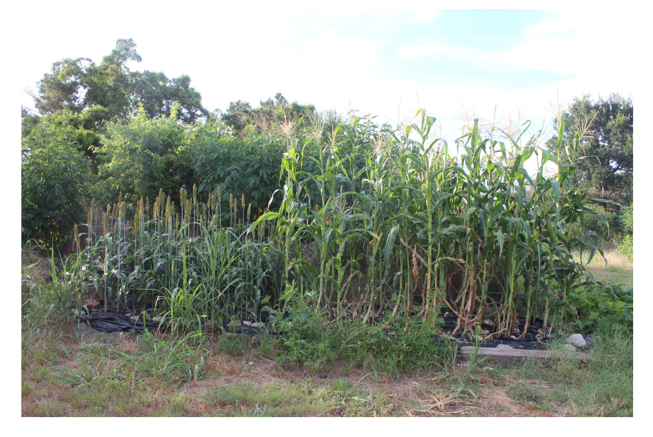
Figure 2: Tasseling and heading out stage

growing food with minimal resources such as water and arable land. In addition to enhancing water use efficiency of irrigation methods (Howell, 2001), it is essential to select crops that optimize the conversion of water into grain (Spiegel, 2015). The dual threats of precipitation and temperature changes make finding water efficient crops that can handle irregular irrigation imperative. The purpose of this research is to simulate climate change in a controlled, yet natural environment, and observe the effects on both corn and sorghum, ceteris paribus.