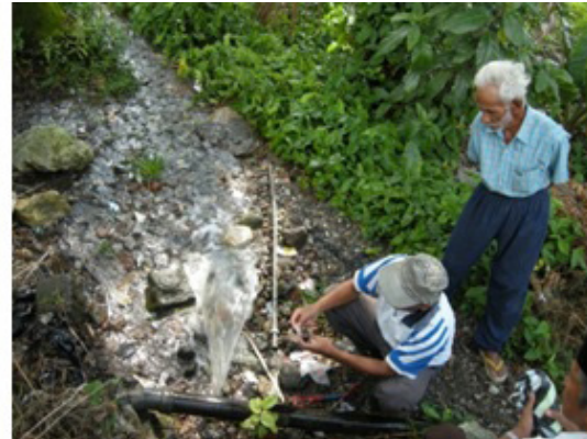
Figure 2: (a) Shadow of the rain area phenomena (Left), (b) small creek to watering the farmland (Right)