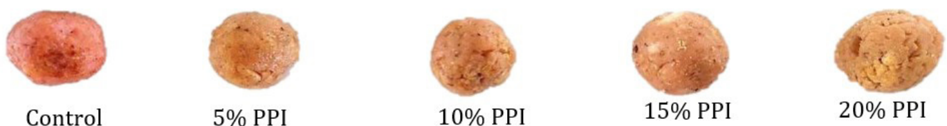
Figure 2. Color of the commercially available plant-based minced meatball (control) and plant-based minced meatball with different pea protein isolate levels (5%, 10%, 15%, and 20%, w/w).

Mean ± SD with different lowercase superscripts in each column are significantly ( p < 0.05 ) different